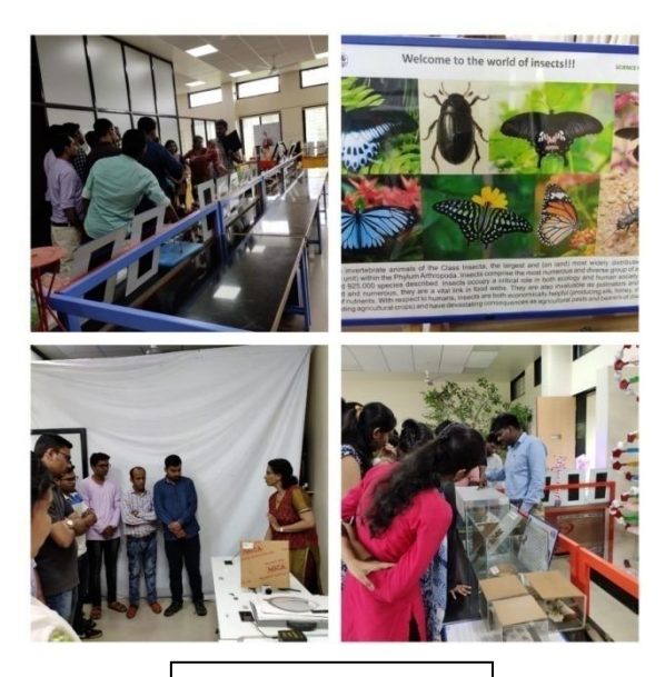
Science Park Visit

On 5<sup>th</sup> September, all UPSC batch students visited the Jaykar Knowledge Resource Centre (Jaykar Library), while MPSC Batch students visited newly established SPPU Science Park. During the Jaykar library visit students were firstly told about its history. They also provided information about the total capacity of Jaykar library. Students were also shown reference, periodical and journal section of the library.